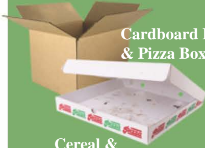
Cardboard Boxes & Pizza Boxes