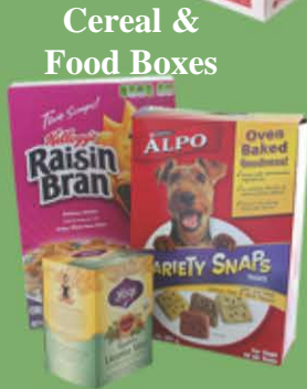
Cereal & Food Boxes